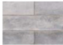
LIGHT AND STORMY

SienaEdge is a complete segmental retaining wall system offering a linear modern aesthetic to any landscape project. The ideally sized block provides fast, efficient machine placed installation, while still offering a manageable weight for manual maneuvering if required.