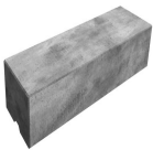
Light And Stormy